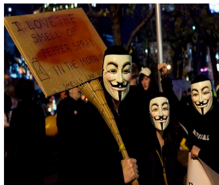
Angrly protesters with a vendetta occupy the streets.

for student loan debts and justice for those who made profit on the 2007 economic meltdown. They have gathered people and supplies with many non protesters delivering whatever is needed for life. Everything from tents and sleeping bags to canned foods, ice chests, and sodas have been donating to keep the movement alive.